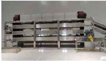
Site-Photos As per usual